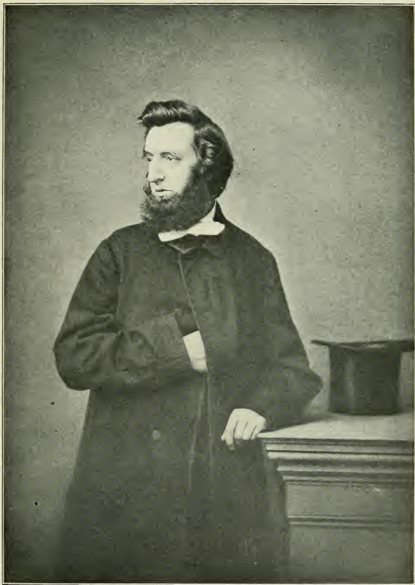
THE REV. WILLIAM BOOTH (1859)